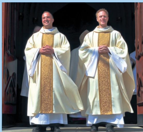
The newly ordained leave the Basilica of the Sacred Heart.