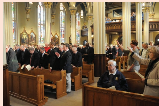
The congregation extends hands in blessing of the brothers.