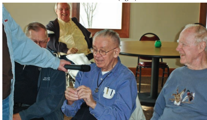
Singing at an outing in LaPorte