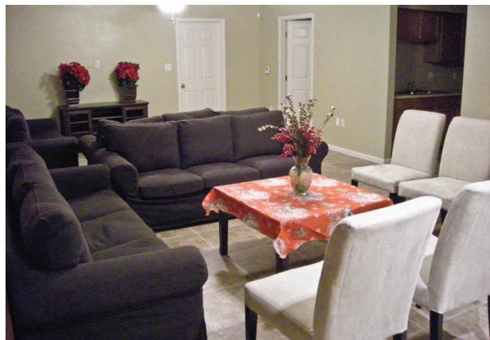
The newly renovated interior

Individuals from the parish have also made the first personal retreats there, and several group retreats are on the calendar. In addition, the two small offices in the house have begun to be used for counseling and marriage preparation. The backyard will include both a prayer garden and a barbeque pit so that parish ministries can use the house for retreats and social gatherings. Sacred Heart House will also provide living space for guests of the parish and visiting members of the Holy Cross and Salesian religious communities.