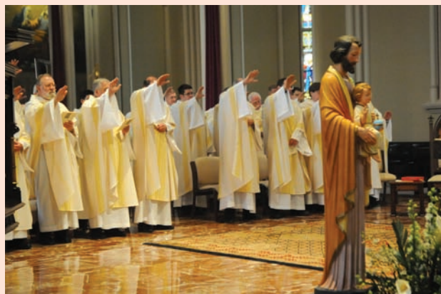
The priests extend hands in blessing of the brothers.