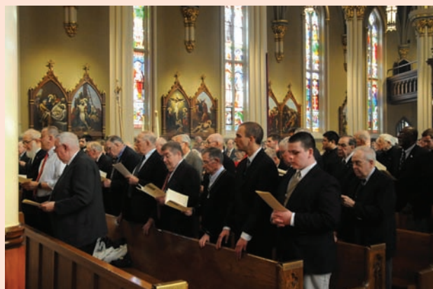
The Holy Cross Brothers

The Congregation of Holy Cross is unique in the Church. There are many congegations with both brothers and priests, but Holy Cross is the only one that gives equal value to both vocations.