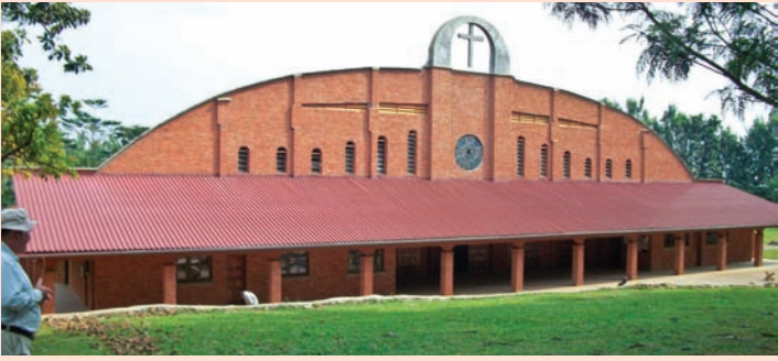
The new parish church at Kyarusozi with Fr. Potthast looking on proudly from the left