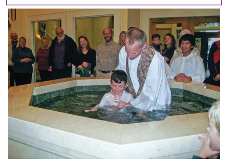
Baptism at Holy Redeemer, Portland, OR