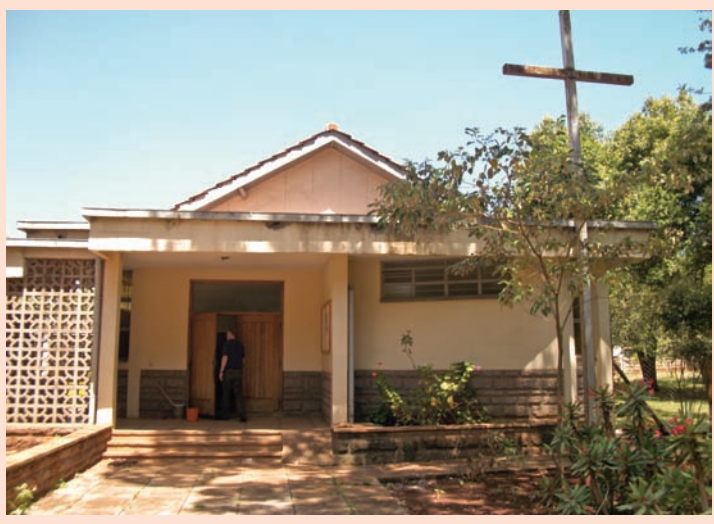
The front of the chapel at the rented formation house