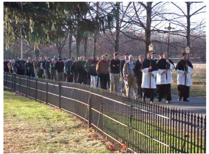
The procession to the cemetery