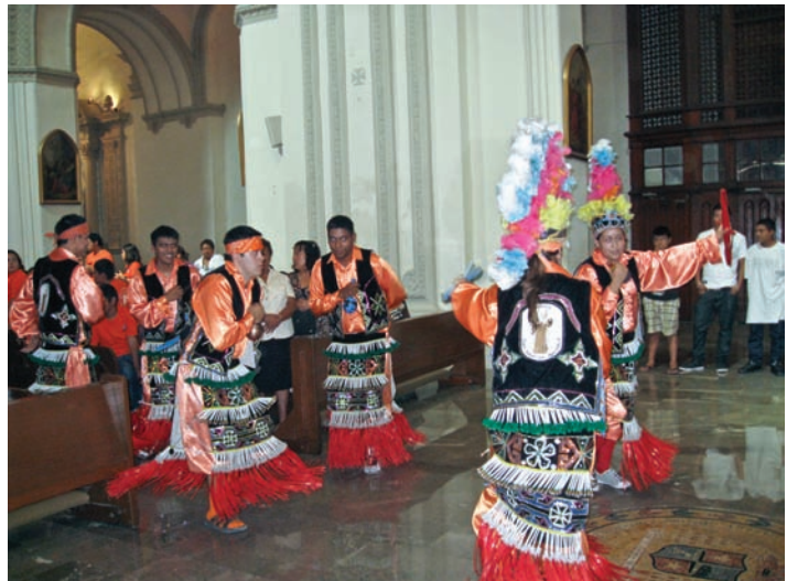
The La Luz matachines dance at the Mass.