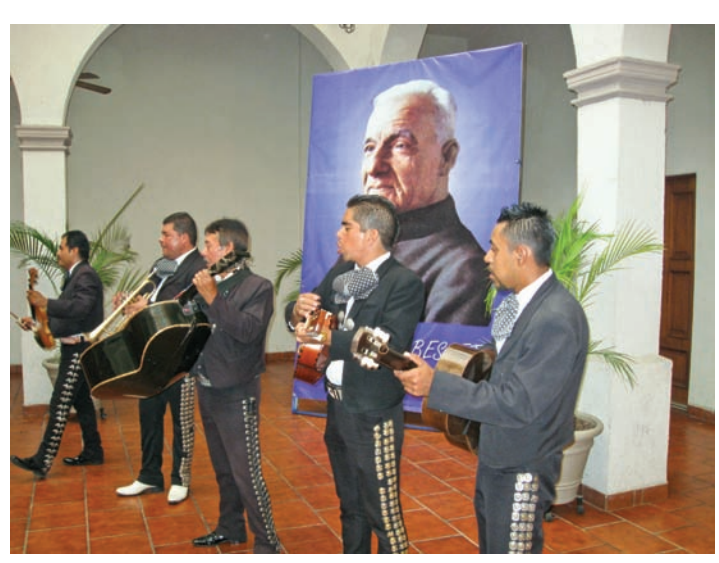
Of course there were mariachis at the Mass and reception