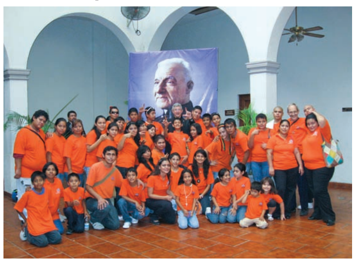
Family Rosary Members with St. André