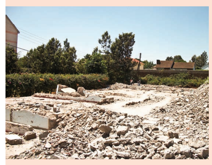
All that is left of the community dining room of the McCauley Formation House in Nairobi, Kenya

The government claimed the property of the McCauley Formation House in Kenya, allowing less than a month to get out and tear it down at our expense. The government claimed that Holy Crosss never owned the land and had been scammed. They are now planning to build a major road through our property. These photos are of what remains of McCauley House after we tore it down. We were able to salvage a lot of the materials and resell them to help defray some of the cost or for use when we build a new house.