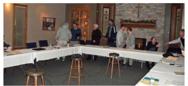
An agreement is reached!