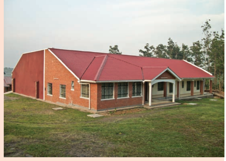
The novitiate at Lake Saaka