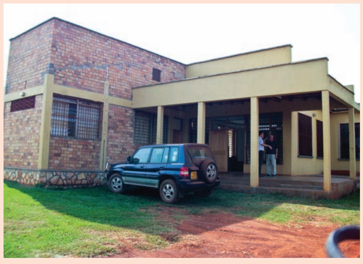
The new residence for all of the Holy Cross men teaching at Holy Cross Lakewide Secondary School