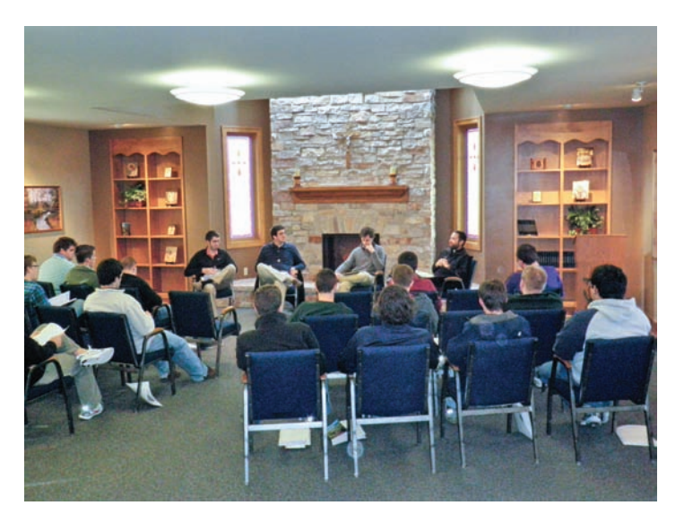
Nineteen college students from across the country attended the Office of Vocation's College Discernment Retreat in November 2010.

Upon leaving the retreat, the attendees remarked, to a man, that the retreat had helped clarify for them the next steps they need to take in discerning God's will in their lives. Several of those men have begun the application process with Holy Cross this year.