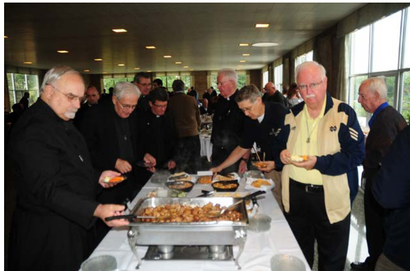
Men from the U.S. and Midwest Provinces gathered for a community Mass and dinner at Moreau Seminary on Sept. 15 to honor Our Lady of Sorrows, patroness of the Congregation.